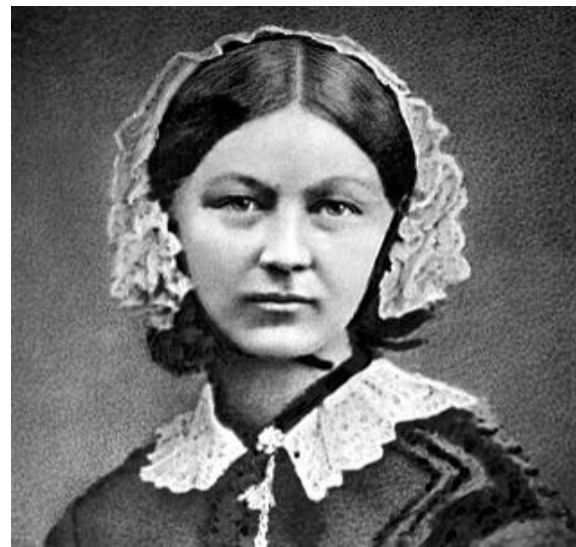
A photograph of Florence Nightingale from 1860.

She also helped wounded soldiers in the Crimean War.