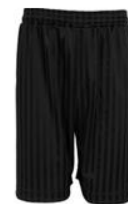
SHADOW STRIPE SHORT